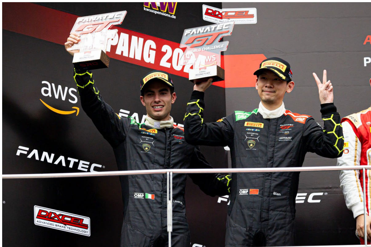
#6 – Bian / Liberati: photo by Kako Photography

VSR's Asian adventure kicked off with a double-header event at the Sepang Circuit in Malaysia this weekend. Bian and Liberati raced in the team's number 6 Lamborghini Huracán GT3 Evo 2 with Zhou and Mapelli in charge of the 63 car. Both cars competed in the Pro-Am class. A sister car, run under ANR with VSR, lined up in Silver-Am with Mizutani and Nemoto driving.