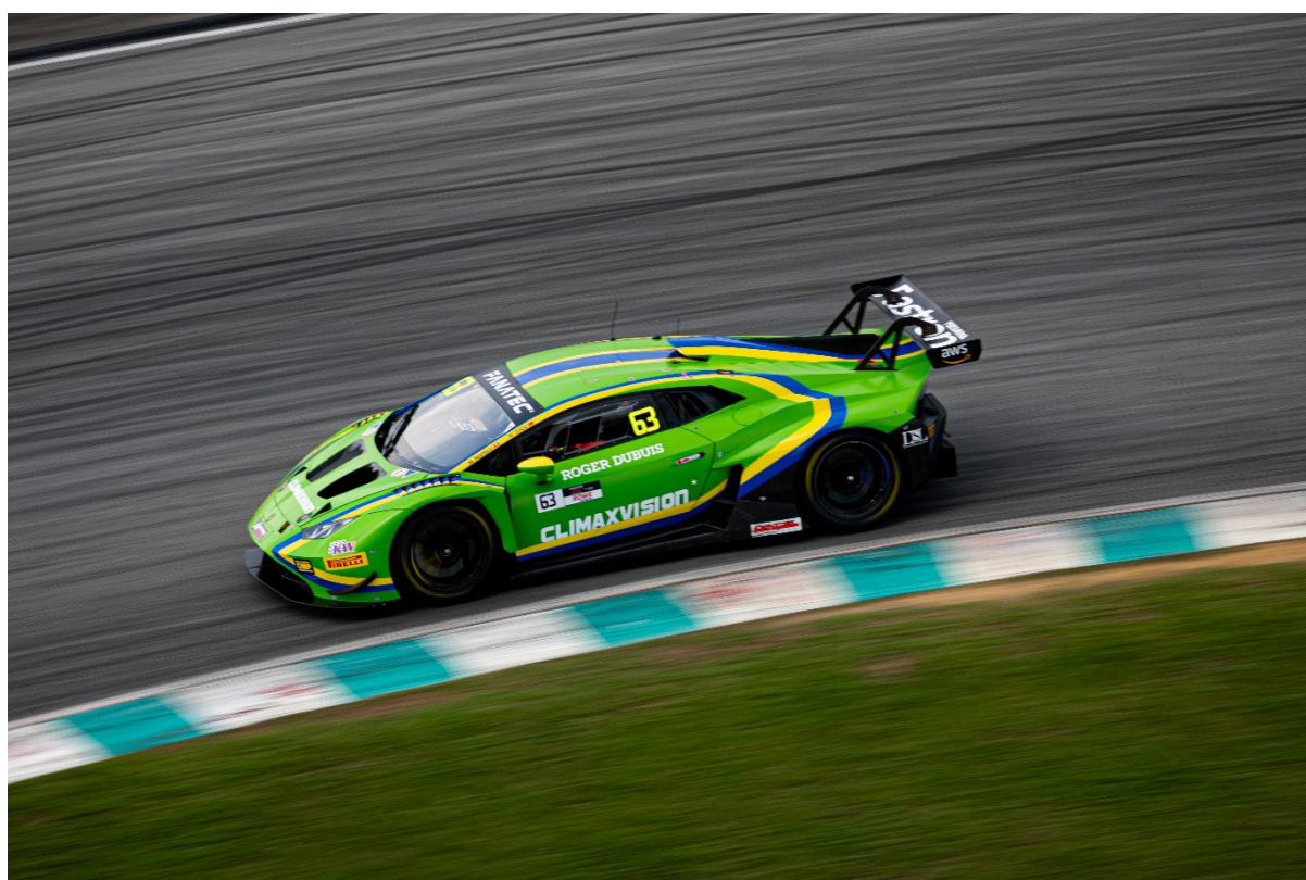
#63 – Zhou / Mapelli

in the stops lost the number 6 valuable seconds and when Liberati rejoined on cold tyres he was passed by Morad and Fong who had pitted a lap earlier. Fong was quick to take advantage of a slow backmarker to wrest the lead from Morad and a lap later Liberati followed him through to retake second and the Pro-Am lead. When the chequered flag fell the battling pair were covered by just two seconds but the win went to Fong. Mapelli recovered to finish ninth in Pro-Am and Nemoto took the flag tenth in Silver-Am.